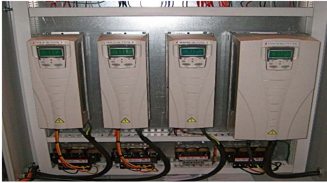
Variable Frequency Drives